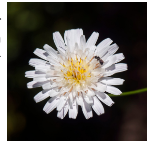
Above: Malacothrix with tiny carpenter bee Left: fiery skipper, Acmon blue, banded garden spider Below: hermit thrush, white-crowned sparrow, American coot

Migrating birds passed through, and winter bird residents settled in.