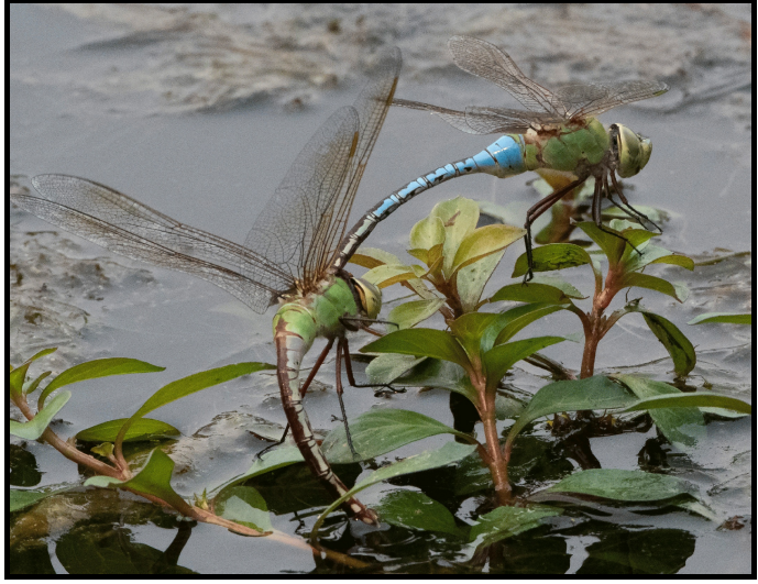
Sunset over the coastal sage scrub; turkey vulture; red-tailed hawk; mating green darner dragonflies